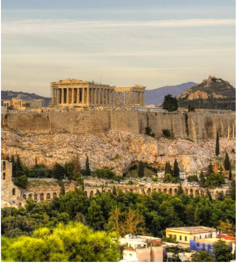
11 Days • 19 Meals: 9 Breakfasts, 3 Lunches, 7 Dinners

HIGHLIGHTS... Athens, Taverna Dinner Show, Corinth, The Acropolis, Mars Hill, 3-Night Cruise, Mykonos, Ephesus, Patmos, Santorini, Thessaloniki, Kavala, Philippi, Meteora